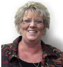
Lisa Boydston Scholarship Committee