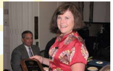
Tachi Palace Hotel & Casino receiving another "Event Sponsor Award".